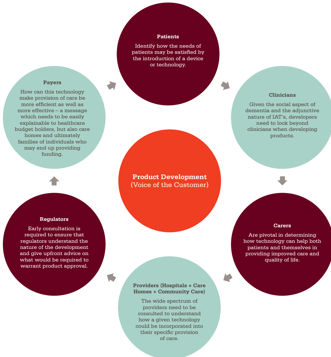
Figure 1: IAT Product Development Cycle [8]

Human assistance will become more remote at a higher level, and will involve supervision of many more patients. To maximise the benefits – both social and economic – of IATs, they need to be compatible with, and integrated into, healthcare systems and services. This will require further investment in IT infrastructure to ensure reliable, detailed and semi-automatic remote monitoring of individuals.